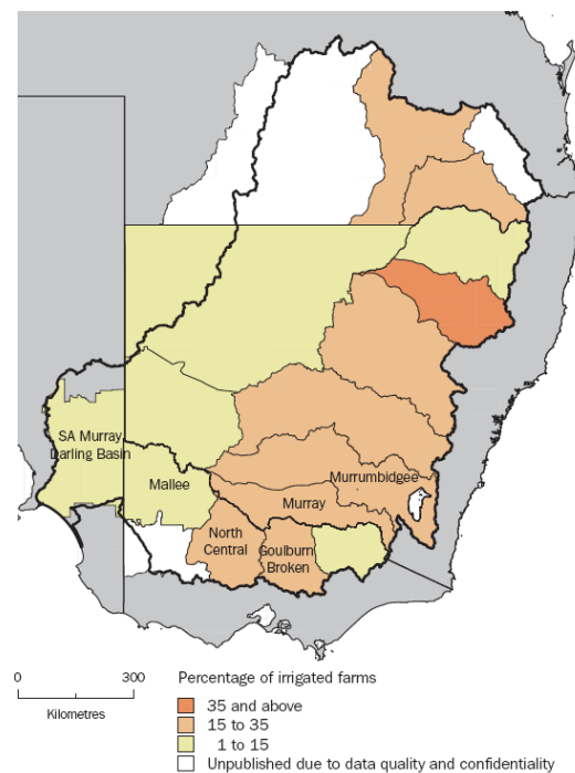
Figure 1 Farms in the MDB that purchased additional irrigation water, by NRM region 2004-05

In 2008, ABARE also released a report on Irrigation Farms in the MDB (ABARE, 2008). It highlighted water trading in 2006-07 and noted that 2% of farms participated in the trade of entitlements and around 23% were involved in the annual/temporary trade in allocations. Reason given for not buying water includes water was not needed (decision not to plant) or the price was too high (driven by horticulture and urban demands). Table 1 below shows the results of this survey.