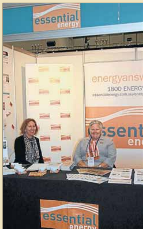
Essential Energy were popular exhibitors at the conference.